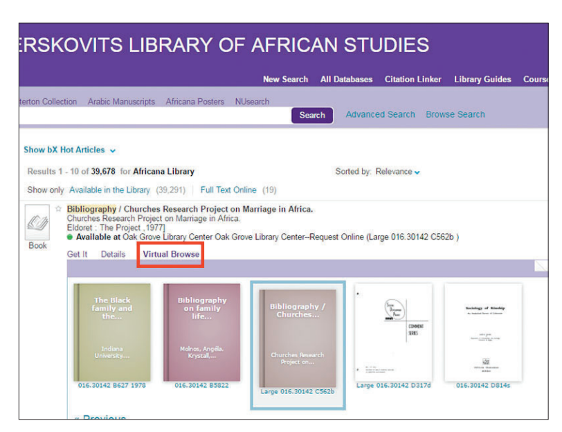
By clicking on "Virtual Browse," NUsearch catalog users can see a representation of the item they wish to view and all of the items next to it on the shelf. Even if an item is housed off site, this feature allows researchers to see closely related books on their topic of interest.