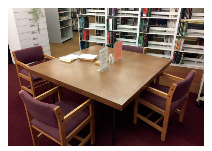
One of the Herskovits Library's reconfigured workspaces

The new configuration includes a collaborative workspace and a comfortable reading nook. There is still some interfiling to be done, so any questions about finding a book should be addressed to any member of the Africana staff.